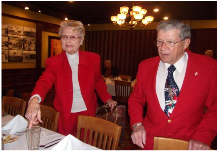
Everyone looked so festive!